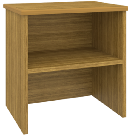
Model: ATBH 20.5W 11.75D 20H

The Atlanta Collection features softly rounded edges and waterfall detailing. Transitional styling make this ideally suited for a wide range of environments. Choose from dozens of hardware styles, including ADA-compliant and soft pulls. Atlanta is customizable and available in various sizes to suit your space.